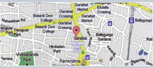
Location in Google Map