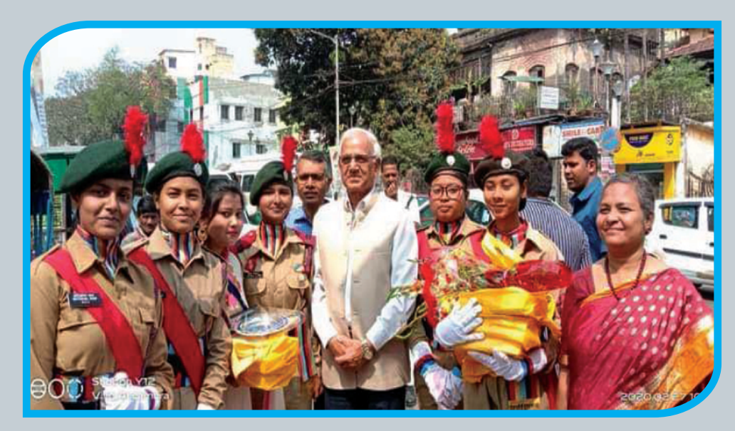
NCC Students with President of GOVERNING BODY