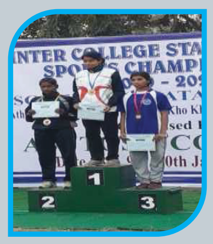
Students in Inter-Collete State Games and SPORTS CHAMPIONSHIP