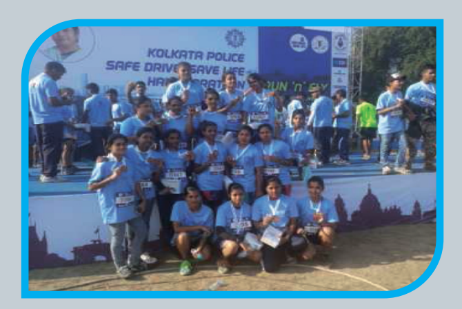
Students at MARATHAN