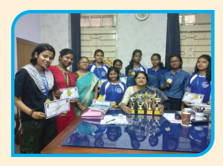
Students after Winning Prizes with PRINCIPAL